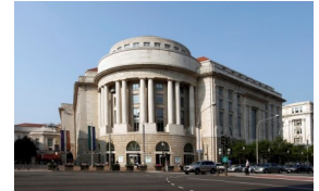
Reagan Building, WDC