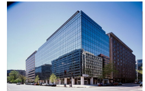
Farragut Square, WDC